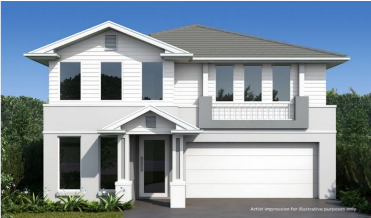
Artist impression for illustrative purposes only