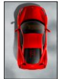
UNDER COVER CAR SPACE 3.6x6.1m

DISCLAIMER: Whilst we deem this information to be reliable, we cannot guarantee its accuracy and accept no responsibility for such. Interested persons should rely on their own enquiries.