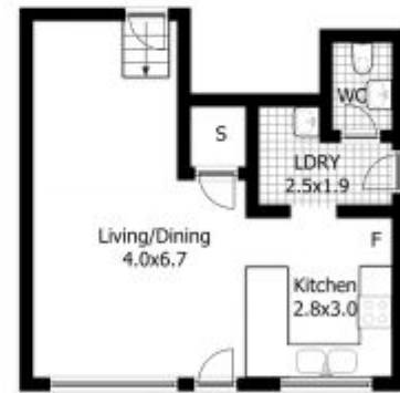
ENTRY LOWER LEVEL