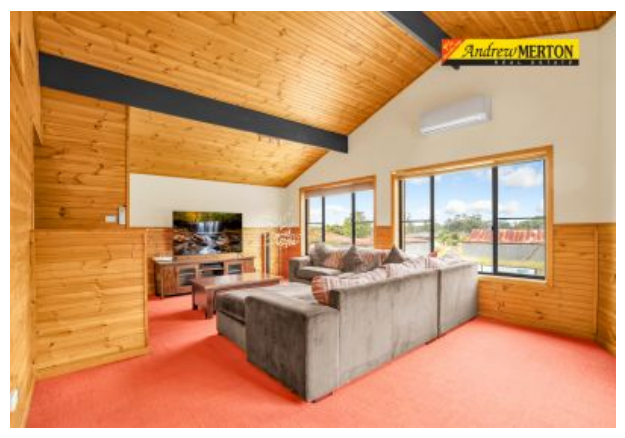
Hebersham, NSW 11 Merrina Street