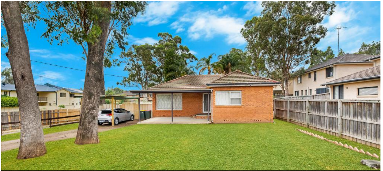
67, 69A , 69 Lalor Rd, Quakers Hill